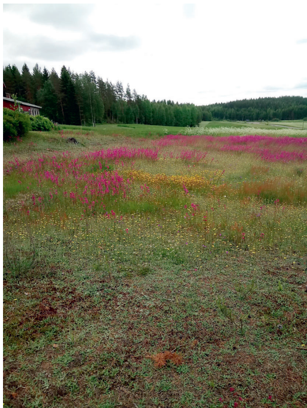
Figure 1. The Vesikkola dry meadow, early July 2017.

A. pilosicollis belongs to the pygmaea species group in the genus Acrotona Thomson, 1859 (Brundin, 1952: 110). Species belonging to this group have